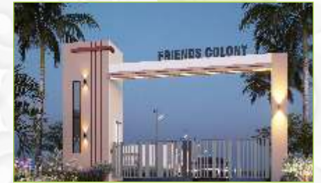
ENTRANCE ARCH & GATE