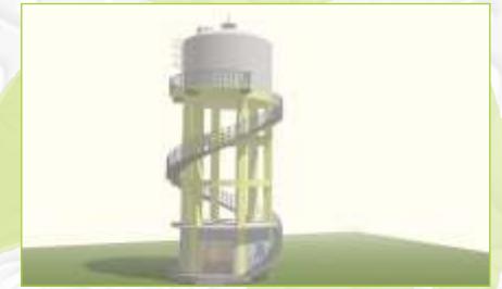
OVERHEAD WATER TANK